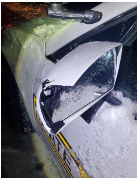
ISP District 10 at 2:00 a.m.

https://isp.maps.arcgis.com/apps/MapJournal/index.html?appid=21430274bef64fc5a19d8dcc191ff3f8