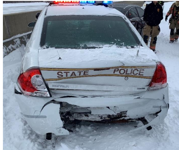
ISP District 9 at 3:22 p.m.

The public is reminded that all persons are presumed innocent until proven guilty in a court of law.