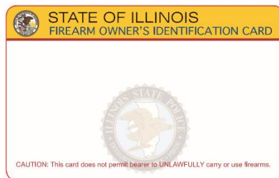
Front Side Card Stock