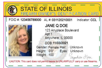
Example New Combined Card

Auto Renewal - When a FOID Card expires during the term of a CCL, the FOID Card will be automatically renewed without paying a renewal fee and the licensee will be sent a new combined FOID Card and CCL. As described above, these combined cards will not have an issuance or expiration date printed on the face of the card and will serve as both the cardholder's FOID and CCL.