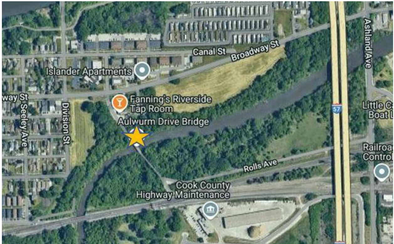
Pineda's body was found in the Little Calumet River near Aulwurm Drive and Broadway Street in Blue Island on March 30, 2007