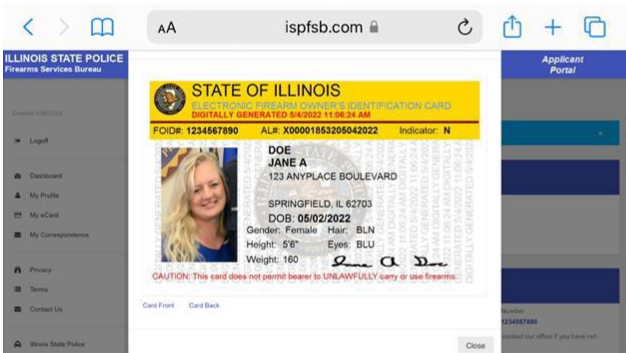
Figure 3 - eCard as seen on mobile device